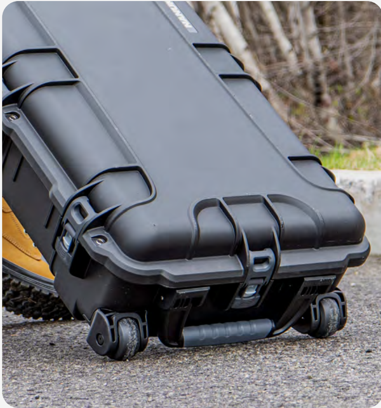
2 Large and Strong Polyurethane Wheels