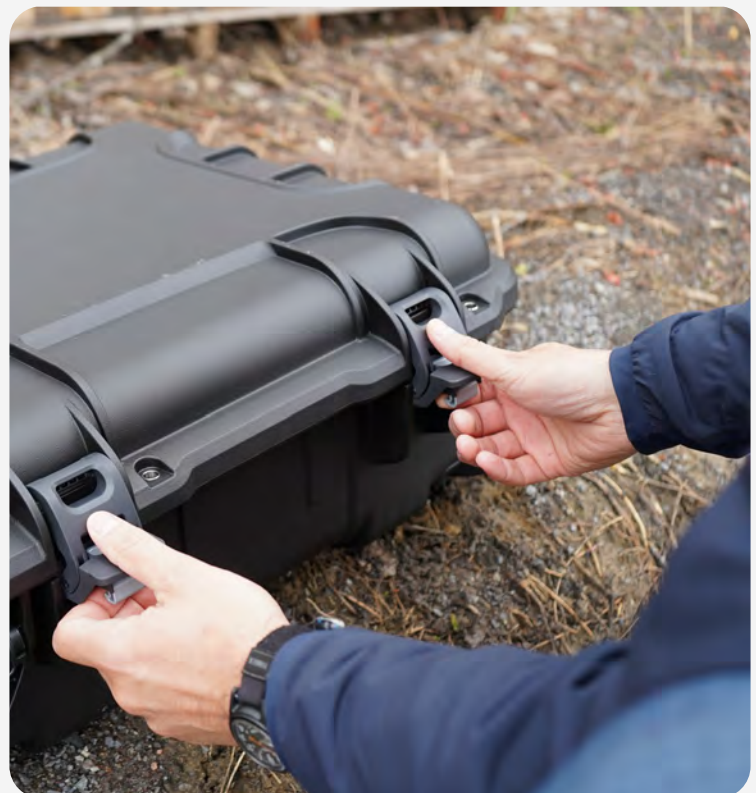
6x Powerclaw Latches