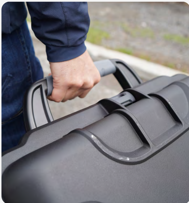
3 Soft Grip Strong Handles